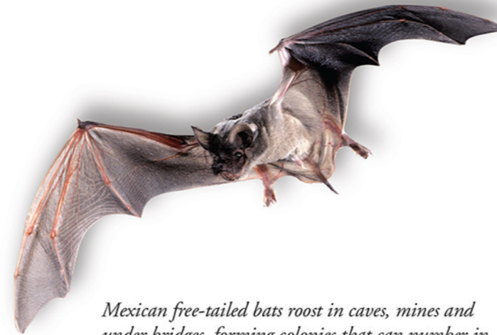
Mexican free-tailed bats roost in caves, mines and under bridges, forming colonies that can number in the millions. They eat enormous amounts of insects, including many costly agricultural pests.

Cover photo: Eastern red bats, like this mother and her pups roost in trees across most of eastern North America. Most bats bear only one pup each, but red bats often give birth to twins and have as many as five offspring. Adults usually roost alone.