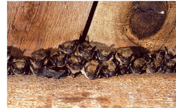
Big brown bats usually live under the bark or in cavities of trees, as well as in various buildings. They feed mostly on beetles, but also hunt an assortment of night-flying insects.

If you think your pet or domestic animal has been bitten by a bat, immediately contact a veterinarian or your health department for assistance and have the bat tested for rabies. Remember to keep vaccinations current for cats, dogs, and other animals.