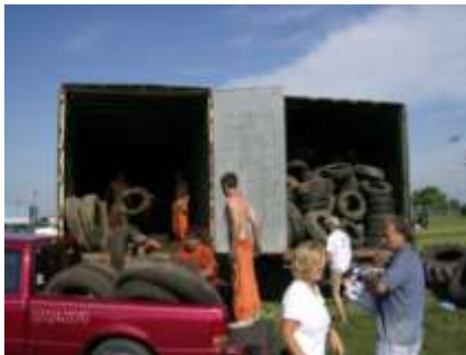
Tire Amnesty Day