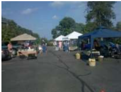
LCHD Farmers Market