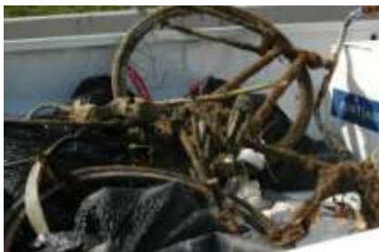
2011 River Roundup