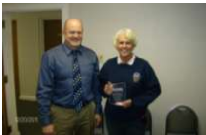
Public Health Guardian