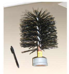
Well scrub brush

All sections of the well casing and open borehole should be physically cleaned with a brush to scrub away all biological growth/slime formations and break up deposited minerals. The brush should be vigorously moved up and down the casing several times to break up and remove slime and deposits. The brush alone will not completely clean the casing, thus requiring a second process, swabbing.