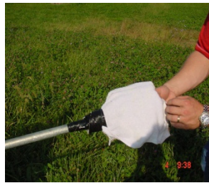
Swab around brush

possibility of entrapment of the brush in the screen. Care must be taken during this step to prevent damage to the casing, especially those constructed of PVC.